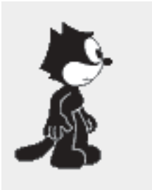
Our CANFP Web Site Expert

Ask The Expert questions can be submitted through our web site, sent to the CANFP office, or emailed to experts@canfp.org