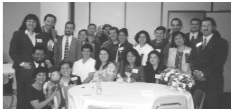
Some of the Spanish speaking NFP teachers from the LA Archdiocese