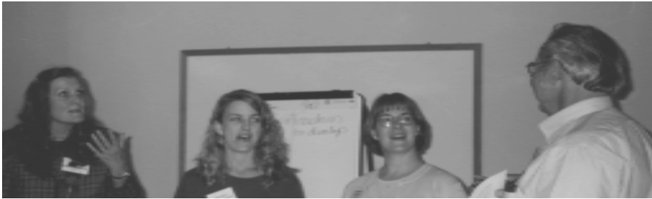
"Participants in the FACTS afternoon workshop role-playing"